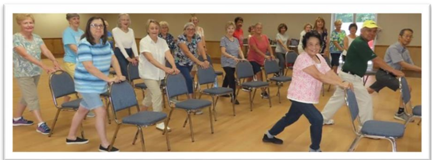
Participants exercising in a Project Healthy Bones Class from Randolph, NJ (2023)